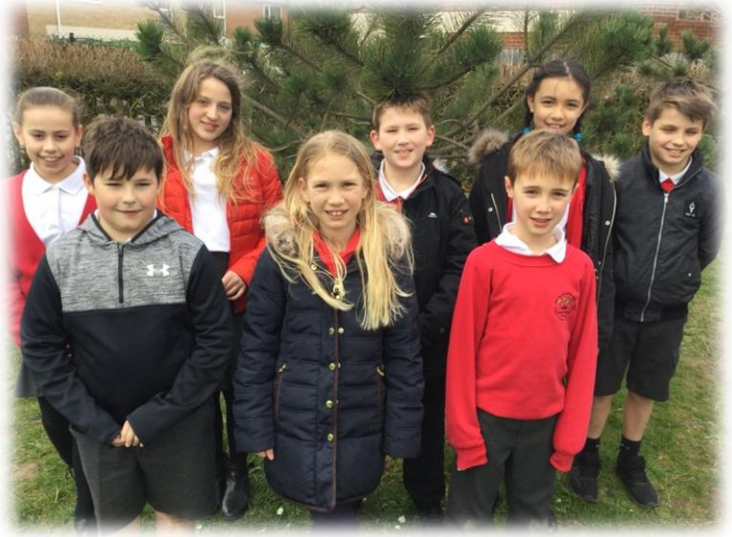
Table Tennis Taster

On Thursday 7 th March, eight children from Year 5 and 6 represented the school in a Schools Games U11 Swimming Gala at the leisure centre. It was a very exciting event, with some strong individual and team swims from the squad. Sebert Wood finished second overall and all swimmers gave their best performances. A very big well done to all involved!