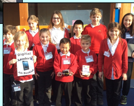
Our team of Digital Leaders